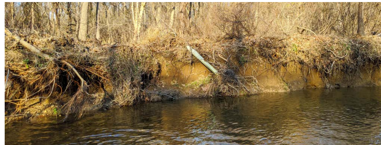
Riparian Buffer Plantings on Legacy Sediments--Pickering Creek

The picture below illustrates the challenges which LS sites present. This healthy riparian buffer planting is no match for the intrinsic instability of these LS sites; the green tube is one of many vigorous young trees in this picture that were installed about ten years ago, and now washing away. Elsewhere in the watersheds, at non-LS sites, riparian buffer creation and protection remains a highly effective approach.