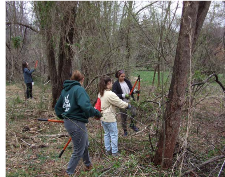
Volunteers Vanquish Invasives & Vines at Welkinweir

This year's volunteer work has focused along the path descending from the west side of the Visitor Lot. Where you see all of the invasives and vines cut off and dangling at head height, you can know that those are some of the trees given new life by our amazing teen volunteers!