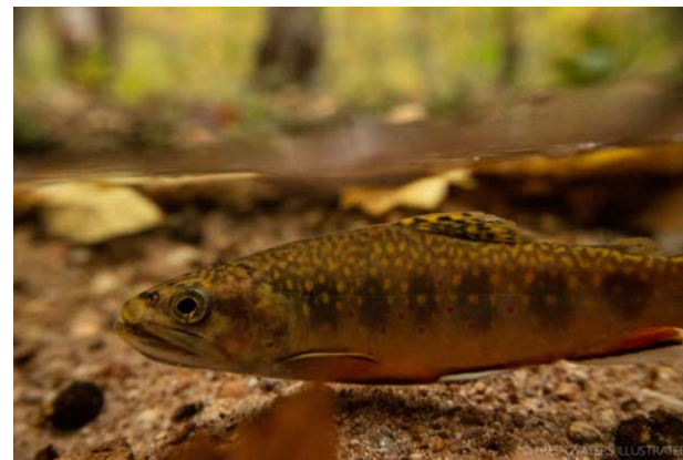
Brook Trout Spawning in Local Headwaters

Native trout still spawn in the headwaters of a few of our cleanest creeks! Running through intact forests, these pristine creeks are time capsules from a pre-European settlement landscape, and the survival of limited populations is both an inspiration and a call to action. Starting from these few headwaters, brook trout could reclaim lost range, but only if we work steadily to preserve and expand the clean cold water habitat they require.