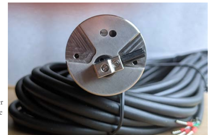
Self-Cleaning Turbidity Sensor

These stations collect data on water depth, turbidity, temperature and conductivity. With this equipment we can measure tons of sediment passing these stations per hour--essential data for understanding current loadings and developing targets for reduction. These same stations will also provide high resolution data on stormwater flows as well as precise and accurate data on chloride from winter de-icing. The picture at right shows the wiper on the self-cleaning turbidity sensors; previous sensors did not have a wiper and consequently required too much maintenance.