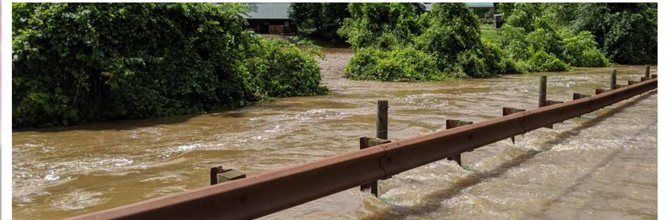
Heavy Sediment Loading in the Birch Run--Hurricane Ida

The severity of flooding in some local watersheds has been worsened by explosive development in the headwaters of these streams over the past several decades. We understand this qualitatively, but we lack the local data to quantify these changes and show the impact that development is having on our watersheds. We also have very limited data on the amount of sediments flowing through our watersheds. Sediments are a major cause of stream impairments that we need to address, but we really can't move forward effectively without a clear understanding of the mechanisms, timing and severity of these events. More data is needed!