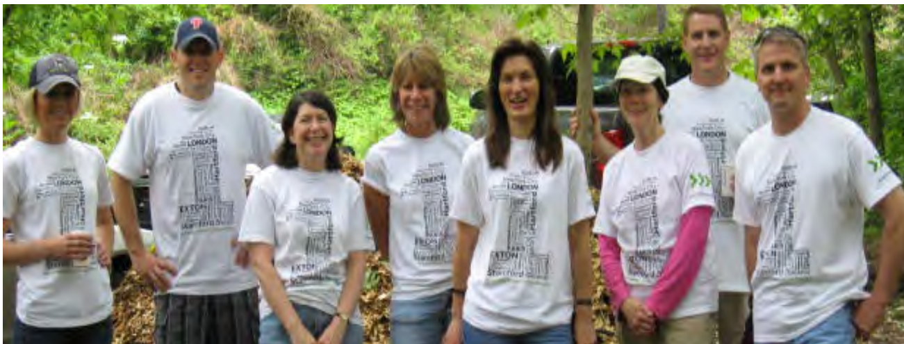
Pickering Clean Up--AXA XL Global Day of Giving

The Exton-based staff at AXA XL, a global insurance and reinsurance company, continues their decades-long commitment to Green Valleys. With a strong focus on corporate social responsibility, AXA XL's annual Global Day of Giving sets aside a day for thousands of employees world-wide to do volunteer work in their own communities. For 20+ years, local AXA XL employees have volunteered for Green Valleys, and the recent focus for cleanup and maintenance of areas along the Pickering and French Creeks, earned them the Ralph D. Heister award for volunteerism.