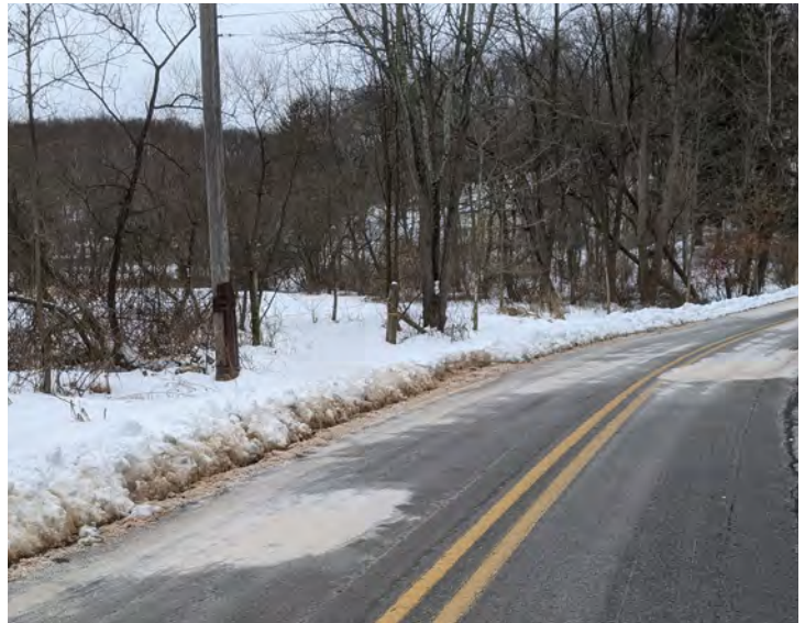
Salt Spill on PennDOT Maintained Road Along French Creek

Decades of salt application to roads and parking areas is responsible. Prior to the 1960s, de-icers including rock salt were not routinely used, but application rates have increased steadily since then, and we are seeing the results in the streams and groundwater. The data in the chart below is from the USGS, and show the long term trend observed in essentially all the streams locally where there is data available.