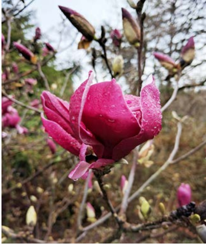
Tribute Tree Magnolia March Till Frost

Tribute Trees and Benches Two programs offer ways to celebrate, recognize, or remember someone special in your life while benefitting others who enjoy Welkinweir’s peaceful setting by planting a tree or donating a bench. The arboretum office maintains a list of desired trees to be planted that donors can choose from and the cost ($250) includes a plant label listing the genus species, common names, where the tree hails from and space for a dedication. Benches of stone ($800) or wood ($1,500) can also be purchased for use throughout the property. A brass plate recognizing the donor is included.