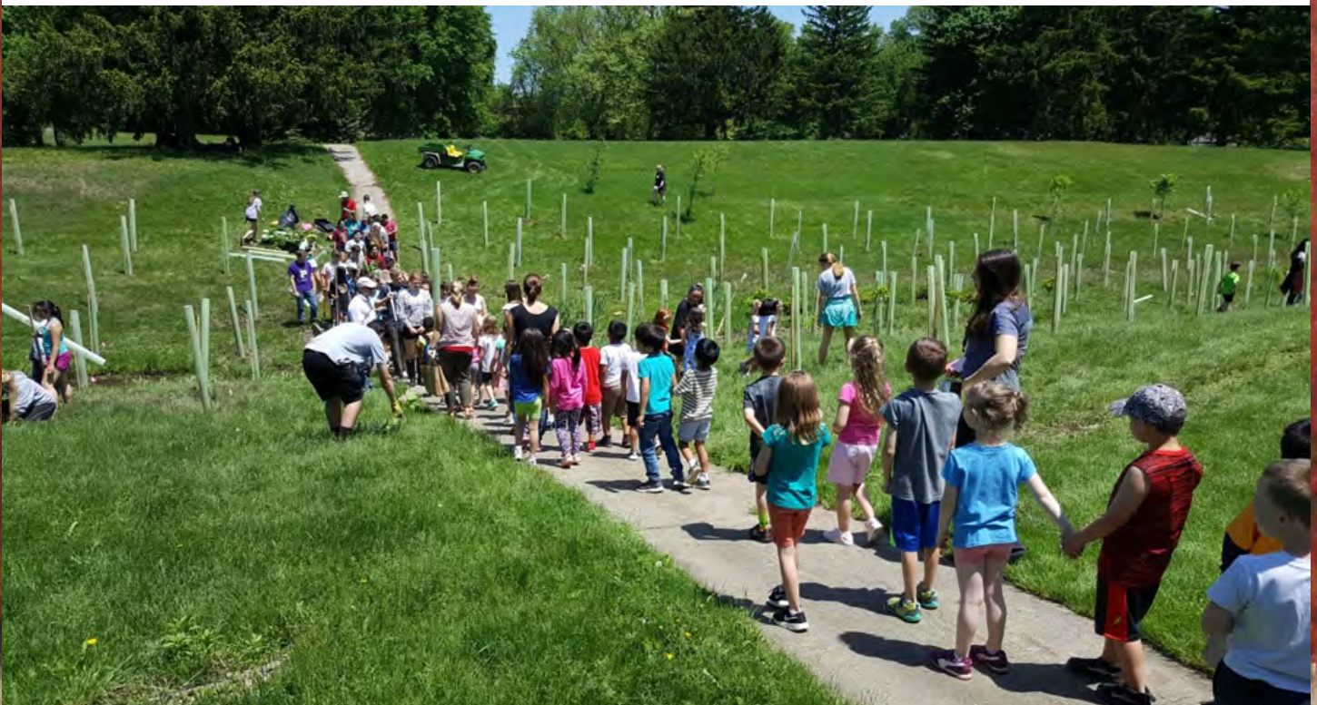
Riparian Buffer Installation at Phoenixville Area School District's Early Education Center May 2018

Township parks, municipal-owned open space, land preserves, and farms - wherever there is a stream that needs trees we are working to get trees growing.