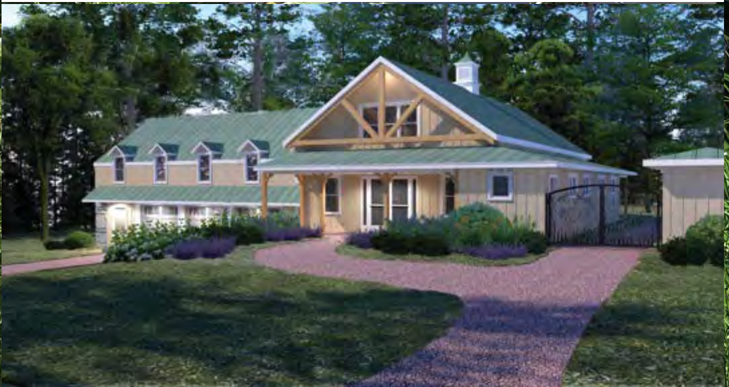
Conceptual design for future GVWA Environmental Education Center.

Portions of our 2017 Annual Appeal funds were used develop conceptual designs. This year's Appeal proceeds will go directly to creating the construction ready drawings we will need for the next phase.