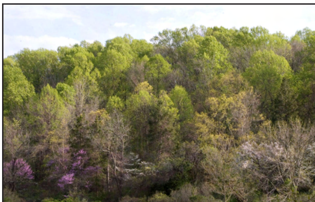
The Welkinweir woods in springtime.

Did you know that Welkinweir's 197 acres are part of the largest tract of forested land remaining in Pennsylvania's southeast region? Known as the Hopewell Big Woods, this 73,000-acre (110-square-mile) expanse of forest and natural lands encircling French Creek State Park and Hopewell Furnace is "an exceptional resource with hundreds of plant and bird species, pristine forest, unique wetlands, and clean streams, providing open space, drinking water, and unique scenic, cultural, and natural resources."