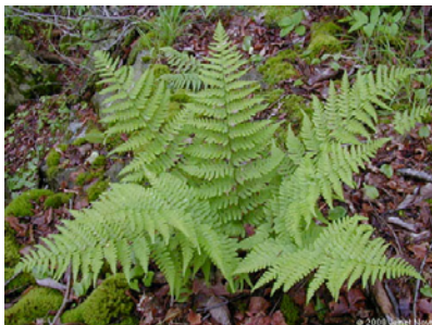
Marginal woodfern.

As I walked through the woods at Welkinweir this winter I noticed a great combination of two native ferns, Christmas fern ( Polystichum acrostichoides ) and marginal woodfern ( Dryopteris marginalis ). These evergreen species were happily growing side by side, forming large sweeps along a wooded hillside. Both make great additions to shade gardens, are deer resistant and relatively disease- and insect-free.