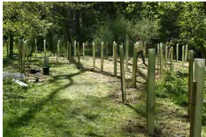
Above: Plastic tube shelters protect young trees from wildlife.