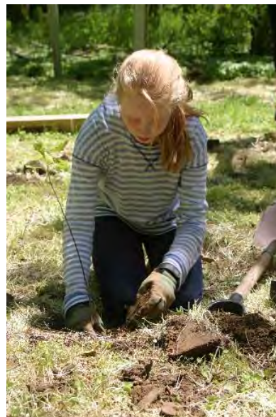
Left: Members of three local Girl Scout troops participated in the tree planting.