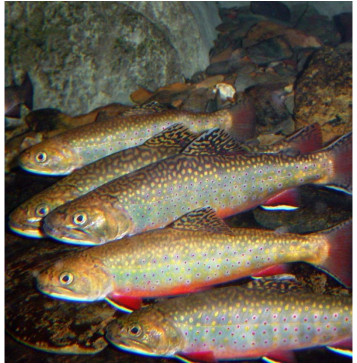
Native brook trout and other trout species require water temperatures between 50° and 65° F to thrive and reproduce. Climate change will cause these fishes' habitats to shrink.

Locally, cold water fish habitat consists of either Exceptional Value (EV) or High Quality (HQ) streams. These streams support a range of cold water species, most notably several trout species very important to recreational fishing. Many of the trout streams are stocked, but we also have wild trout streams across the watersheds, including Class A wild trout streams in Valley Creek, and native wild Brook trout ( right ) in Sixpenny Creek in southern Berks County. Under the higher emissions scenario, cold water habitat disappears from the entire east coast of the U.S. by 2100; with reduced emissions, projections show that a majority of this habitat is preserved, although losses in southern Pennsylvania are still high. The full report is available for download at http://www2.epa.gov/cira/downloads-cira-report . –Michael Bullard